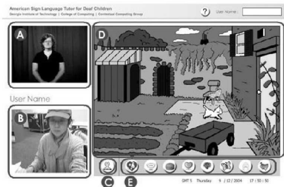
Figure 1. Screenshot of Game Interface. a) Tutor Video b) Live Camera Feed c) Attention Button d) Animated Character and Environment e) Action Buttons

Our project involves the development of an American Sign Language (ASL) game which uses gesture recognition technology to develop ASL skills in young children. The system is an interactive game with tutoring video (demonstrating the correct signs), live video (providing input to the gesture recognition system and feedback to the child via the interface), and an animated character executing the child's instructions. The system concentrates on the practice and correct repetition of ASL phrases and allows the child to communicate with the computer via ASL. We target children attending the Atlanta Area School for the Deaf (AASD), ages 6–8, who are behind in their language development.